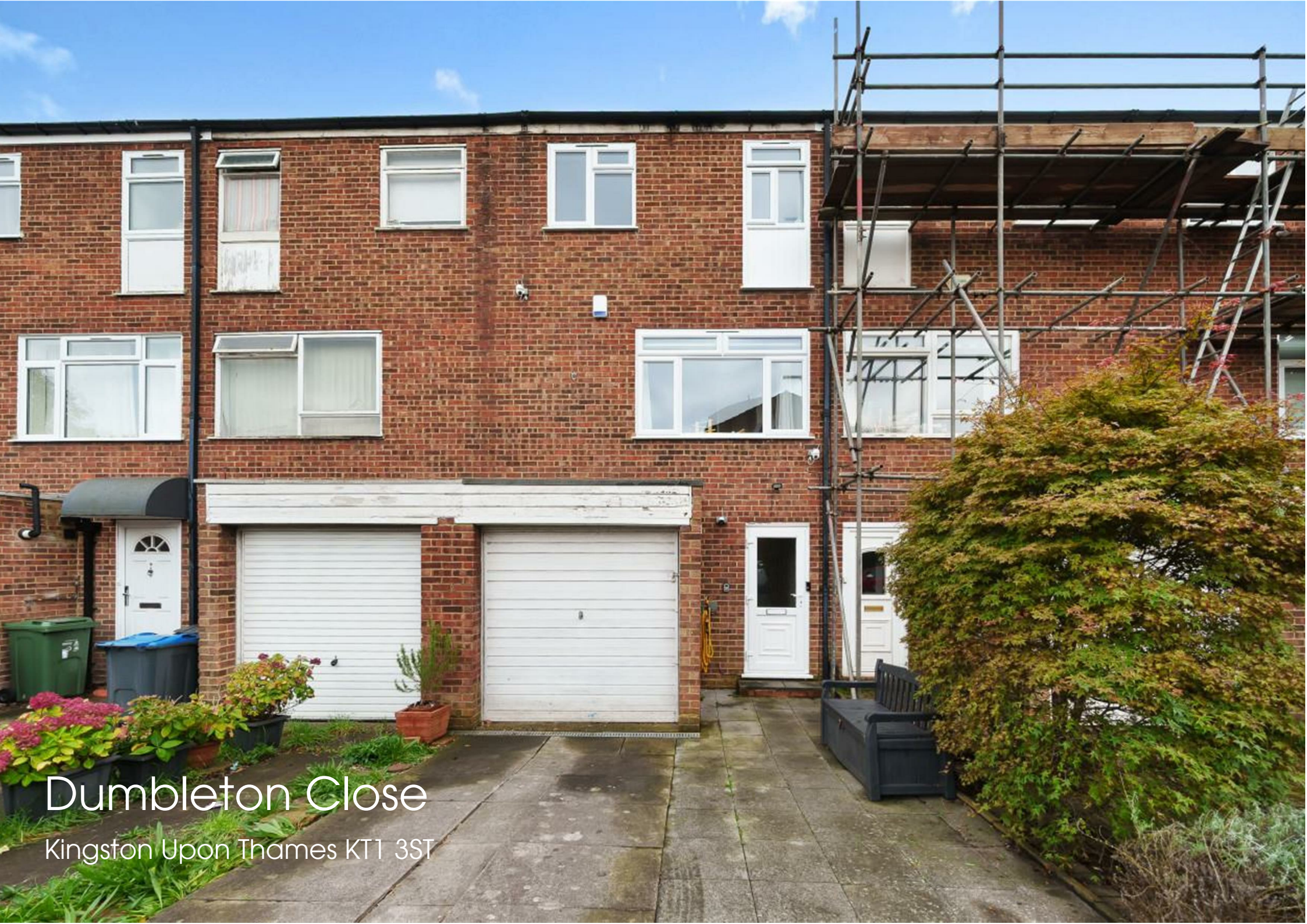
Dumbleton Close Kingston Upon Thames KT1 3ST